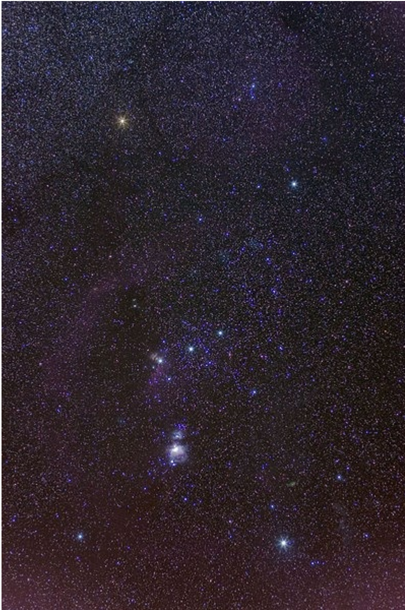
Image: Deep sky image of the constellation Orion.